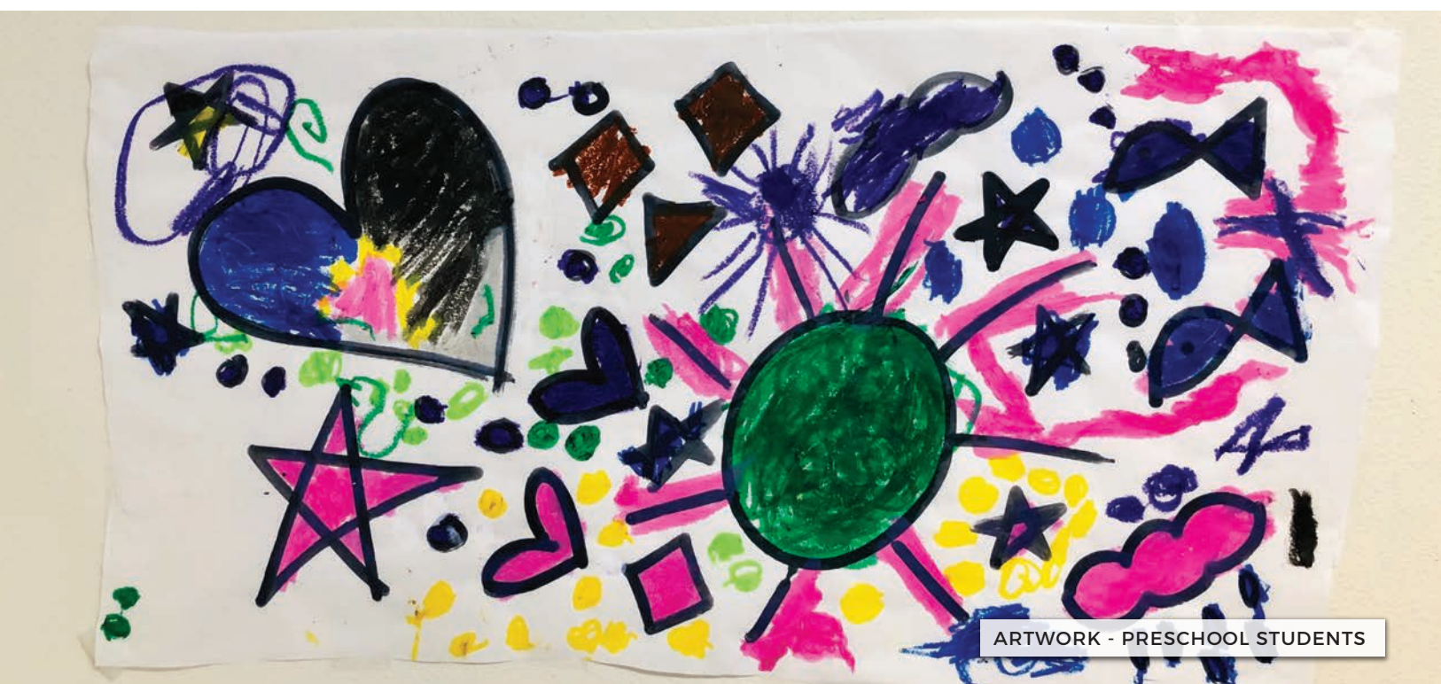
ARTWORK - PRESCHOOL STUDENTS