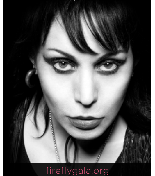
FORTY CARROTS FAMILY CENTER

THE RITZ-CARLTON MEMBERS GOLF CLUB <u>Cocktails</u> • Dining • Private Concert